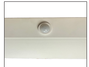
ZLS05-ILW PIR Sensor.