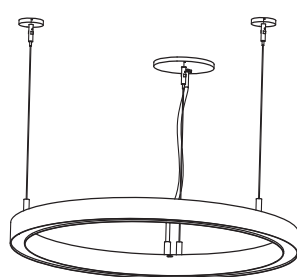
24" and 36" will have (3) hanging points

Multiple Suspended will require remote driver box (not shown).