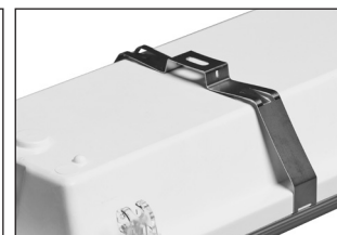
HB-Stainless Steel Hanger Bracket