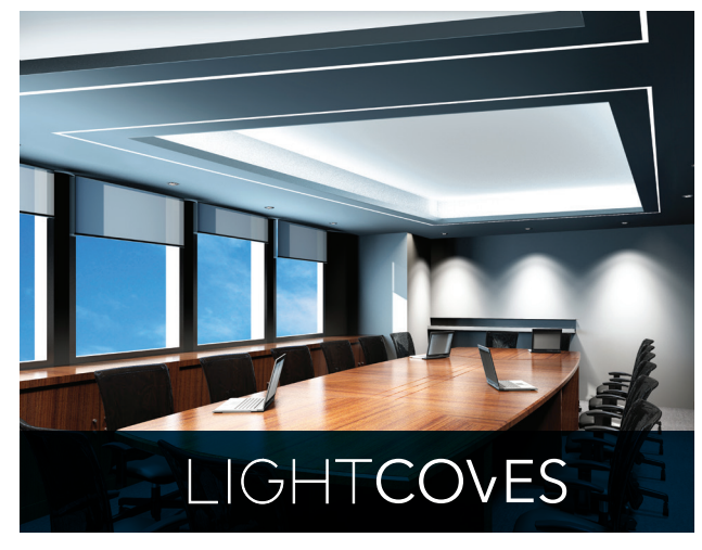
Self-containing cove systems provide integral linear LED illumination built into beautiful sculptured coves.