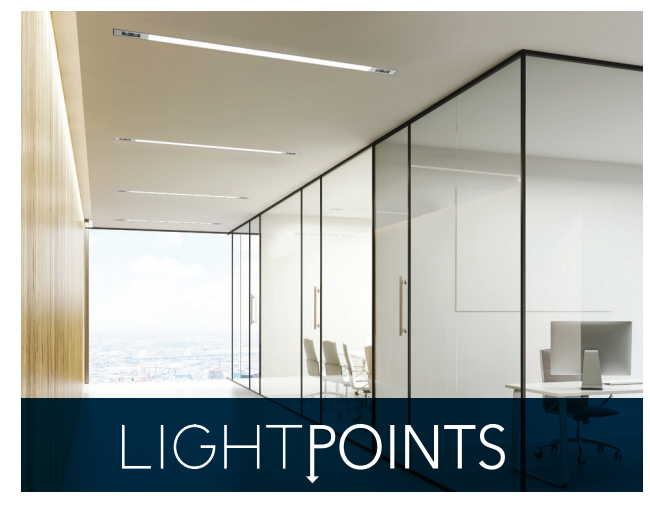
Downlights or other point source LED modules can add accents, drama or special architectural effects to our linear products.

We hope you enjoy learning about our latest lighting innovation.