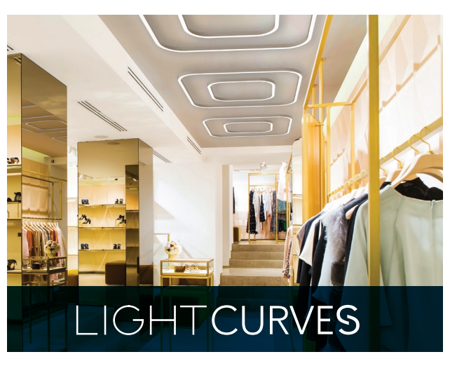
Our ability to curve our linear products offers exciting possibilities to lighting designers.