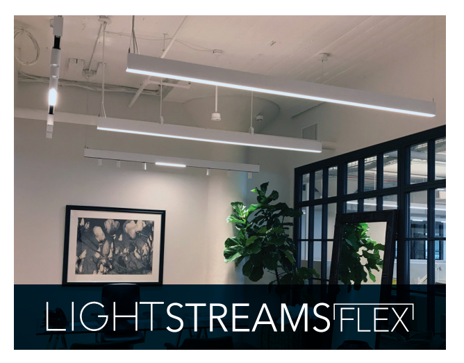
A simple, and secure modular lighting system that integrates with our standard LightStreams products. Easily slide, rotate and adjust your lights to changing room requirements.